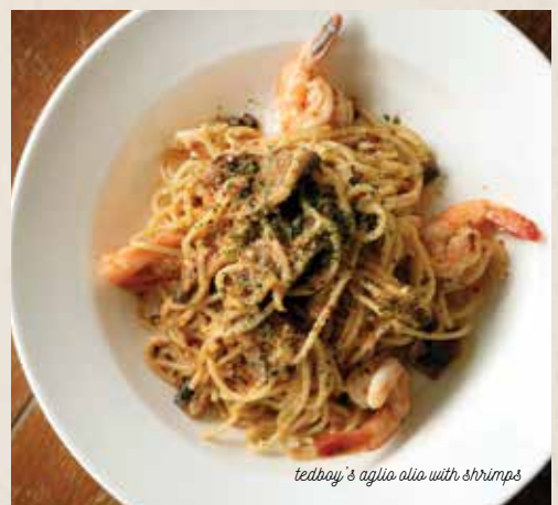
tedboy's aglio olio with shrimps

Traditional chicken dish "cooked-red" braised in spicy tomato sauce 16.0