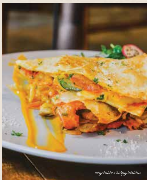
vegetable crispy tortilla