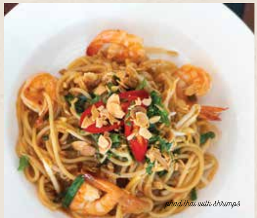
phad thai with shrimps

Traditional herbed tomato-based sauce with grilled chicken, topped with parmesan 17.0