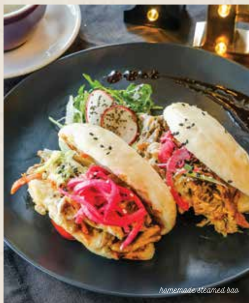
homemade steamed bao